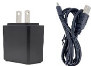
Fast charge adapter and CtoC data cable